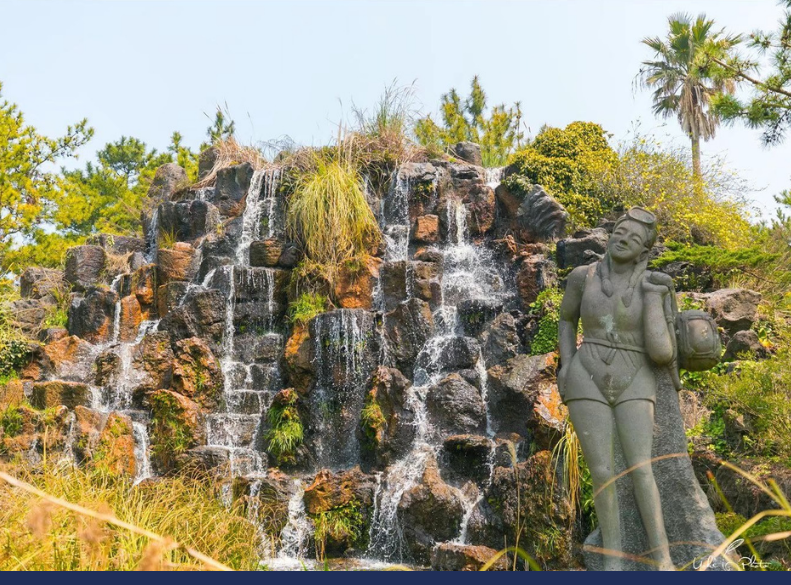
Tour Package - Day Tour - Hotel Booking - Air Ticket - Transport