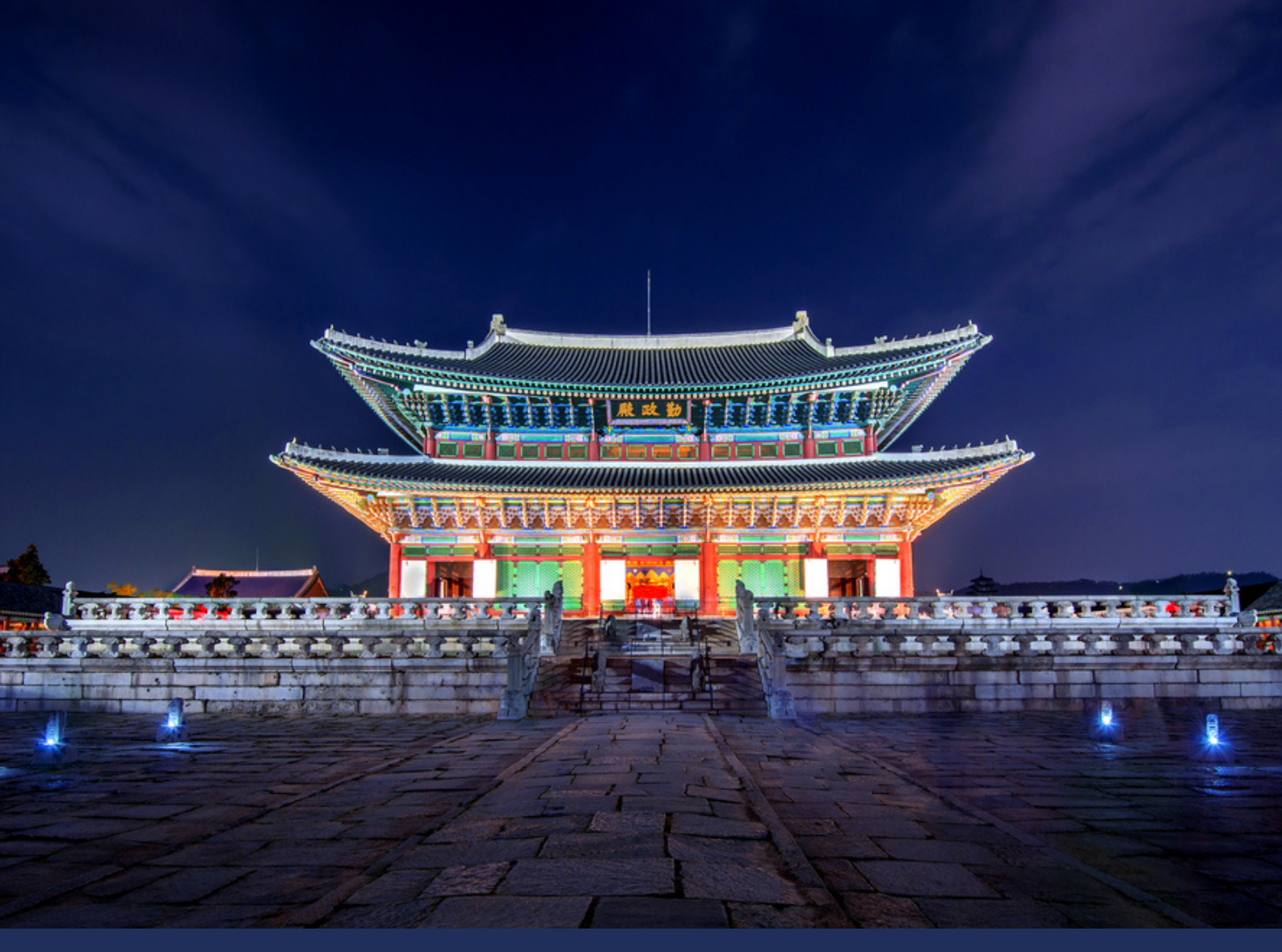
Tour Package - Day Tour - Hotel Booking - Air Ticket - Transport