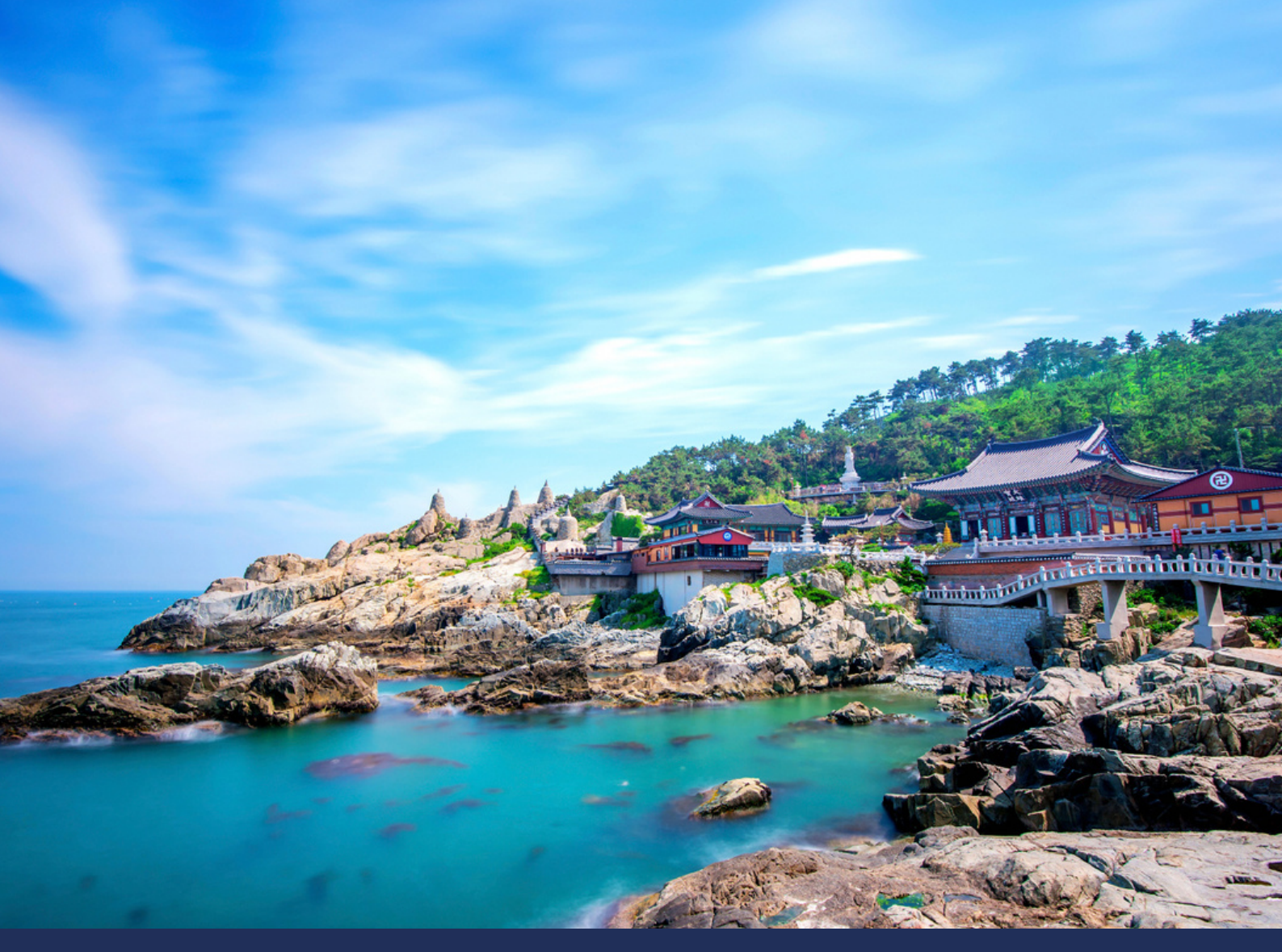
Tour Package - Day Tour - Hotel Booking - Air Ticket - Transport